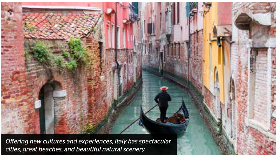
Offering new cultures and experiences, Italy has spectacular cities, great beaches, and beautiful natural scenery.

You'll have to prove to the French authorities that you have a pension or other means of financial support, as well as a health plan to meet the cost of healthcare.